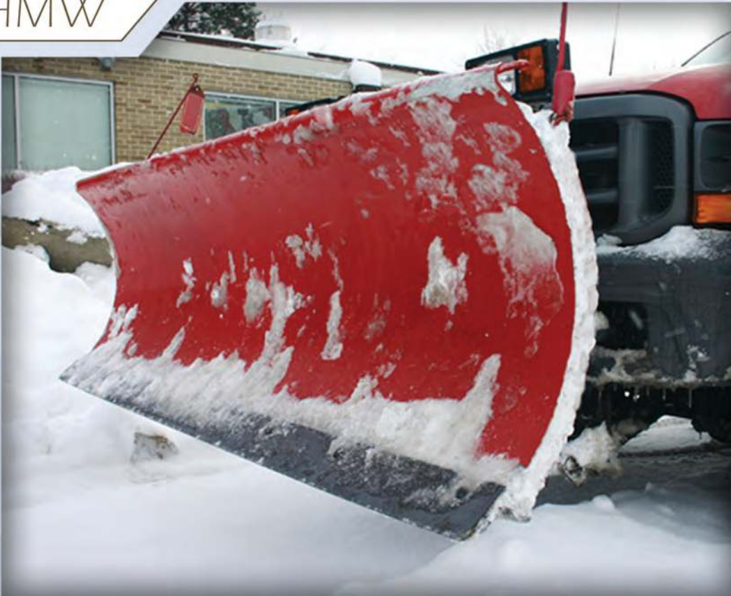
High Molecular Weight Polyethylene Sheet – PE 500