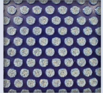
Braxx® - Sand