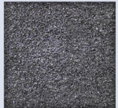
Luns® - Slag