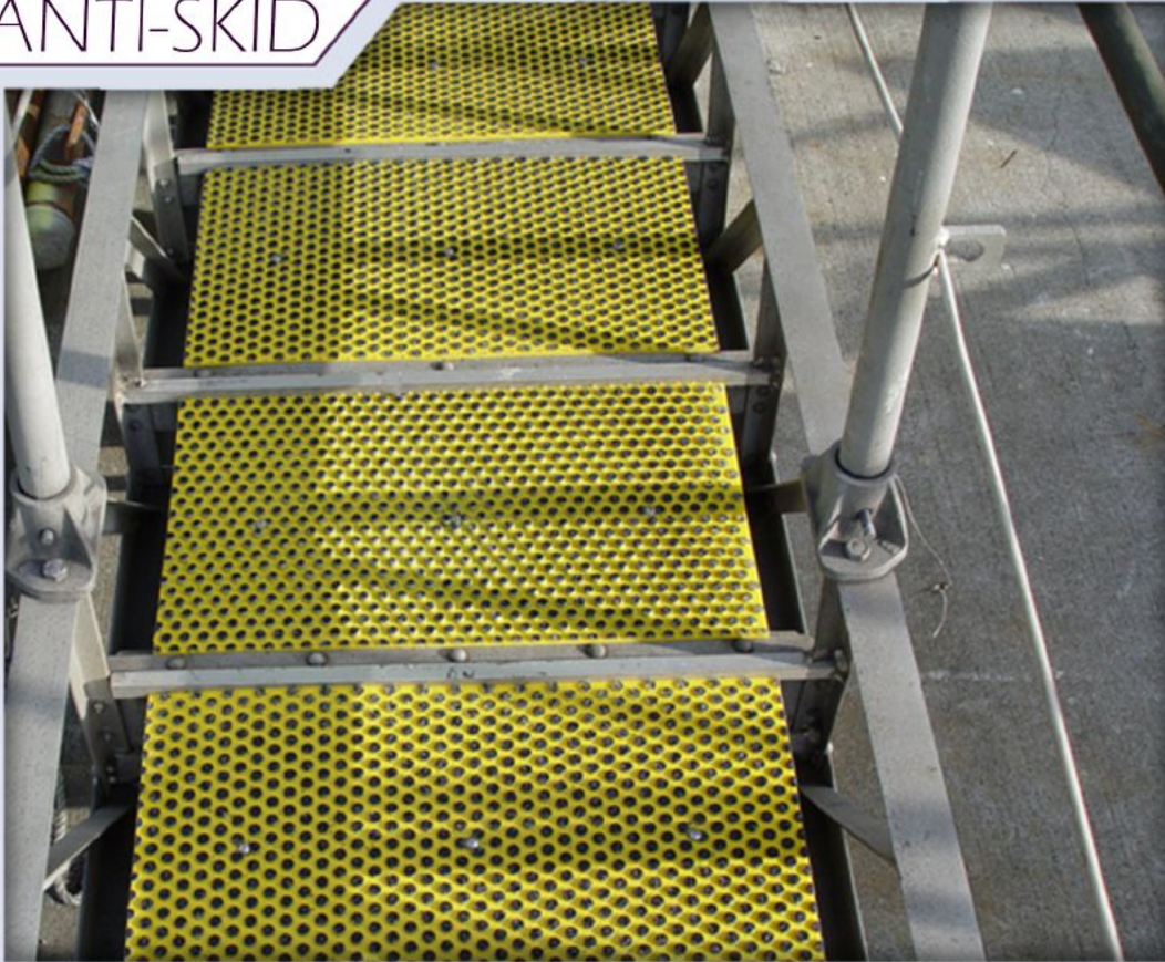
Ultra High Molecular Weight Polyethylene - Braxx®