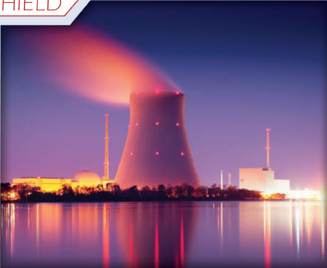
Borated Polyethylene Sheet