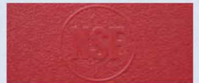
NSF Logo Finish