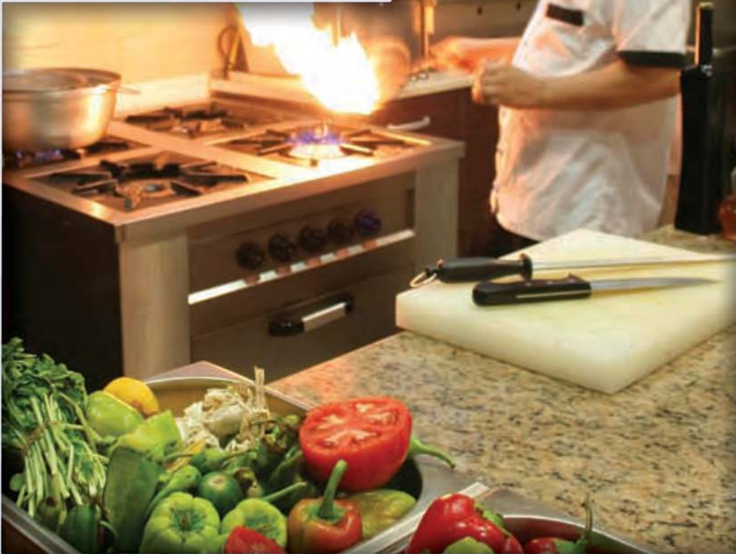
High Density Polyethylene Sheet- PE 300