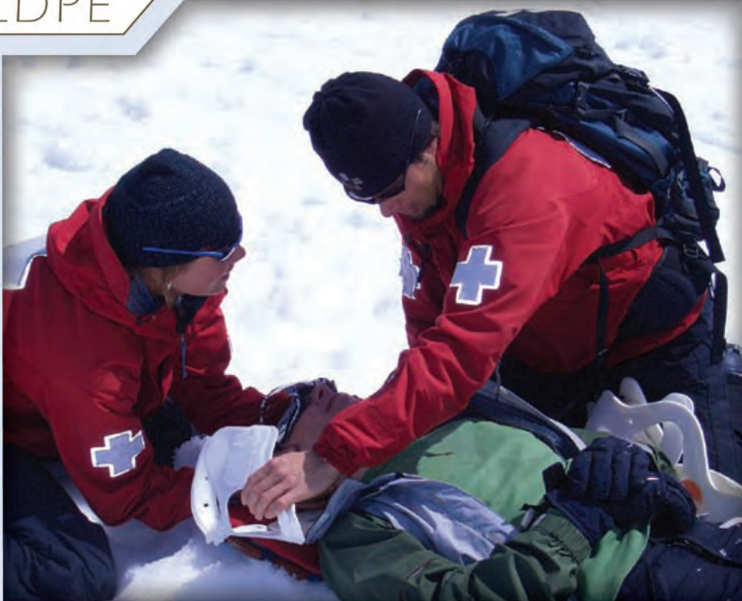
Low Density Polyethylene Sheet