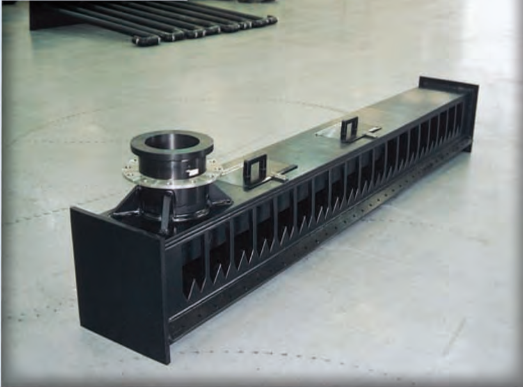
High Density Polyethylene Pipe Grade Sheet - PE80/PE100