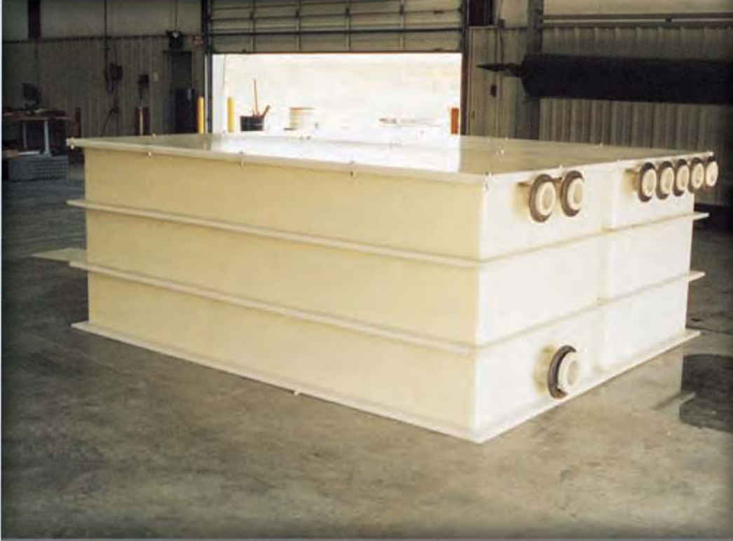
Homopolymer And Copolymer Polypropylene Sheet