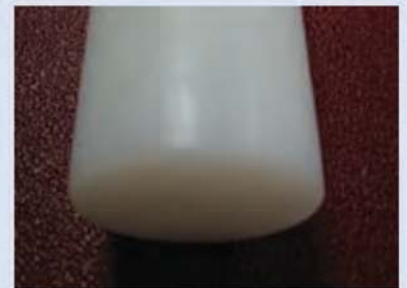
Smooth as Extruded