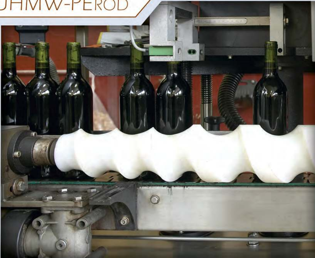
Ultra High Molecular Weight Polyethylene Rod – PE 1000